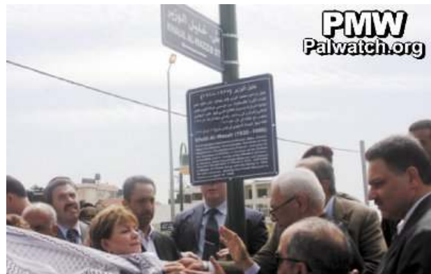
[Al-Ayyam, April 21, 2010]