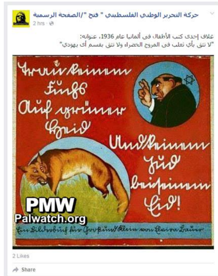
Image and text posted to official Fatah Facebook page on Oct. 29, 2015

“Trust no fox on his green meadow, and trust no Jew on his oath”